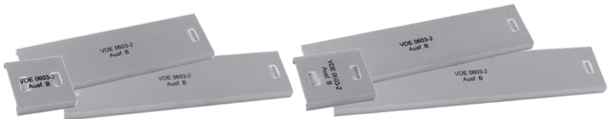
MAF Cover 1P25

Insulating cover for branching terminals.