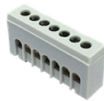
A7H, N7H, PE7H

These bridges have IP20 protection class. They are offered in three color variations.