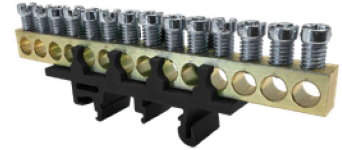
A14, N14, PE14