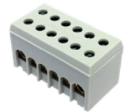
A6H-2, N6H-2, PE6H-2