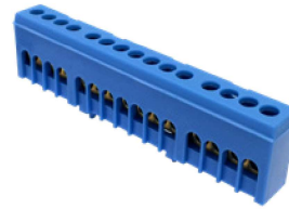
A15H, N15H, PE15H