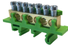
A7, N7, PE7

IP00 and are intended for location under cover. They are offered in three color variations.