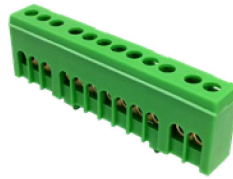
A12H, N12H, PE12H