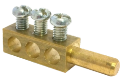
3x 16 mm 2