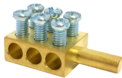
6x 16 mm 2