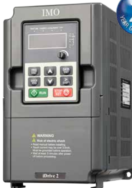
iDrive2 (without filter)